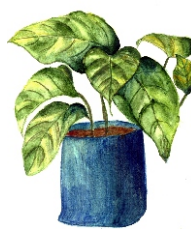
KHUSHI PATEL GRADE - XA