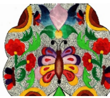
BHOOMI GOSAR GRADE - IVA