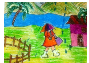
KHUSHI SHAH GRADE - IVA