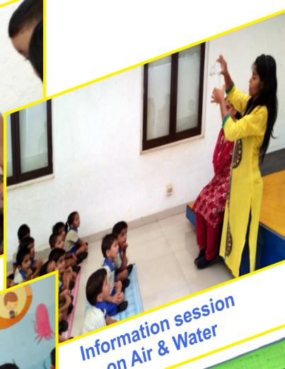
Information session on Air & Water