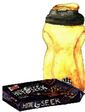
PARI NIRMAL GRADE - XA